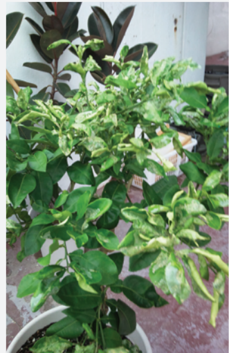
Extensive citrus leafminer damage to growing tips.

In 2000, the then Department of Agriculture and Fisheries, now Environmental Protection, collaborated with a leading researcher in this field from the University of Florida to import an encyrtid endo-parasitic wasp (non-stinging), Ageniaspis citricola , that was known to be extremely effective in controlling the citrus leafminer.