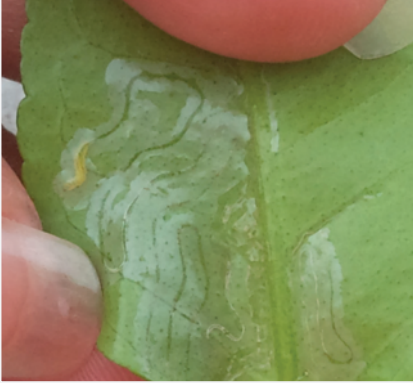
Citrus leafminer larva with trail.

Citrus tree owners are reporting that their trees are being heavily damaged by an insect pest known as the citrus leafminer ( Phyllocnistis citrella ).