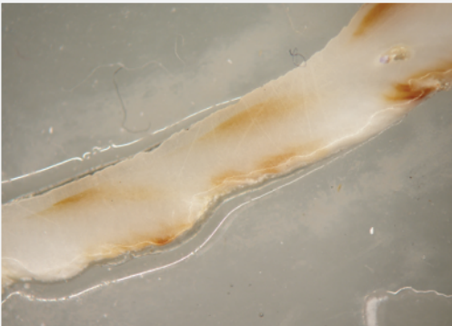
Figure 2. A shell slice, showing growth lines inside the shell.

This summer, we have also been investigating another aspect of turkey-wing mussel ecology: